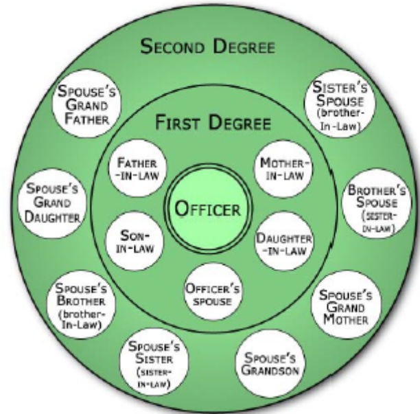
AFFINITY KINSHIP Relationship by Marriage